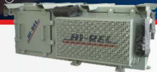
25kVA Under Slung Inverter

The new IGBT based PWM inverter from Hitachi Hi-Rel using latest technology 8-bit microcontroller is successful development of energy supply system for Railway application. Under Slung AC package unit offered by Hitachi Hirel provides proper air conditioning for AC coaches. The unit consists of the following basic section.